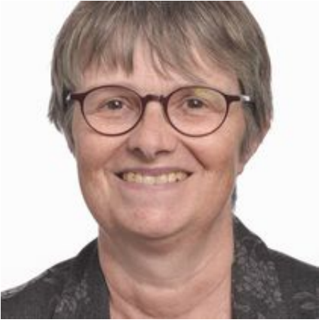
Molly Scott Cato