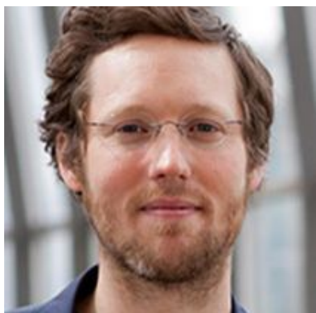
Jan Philipp Albrecht