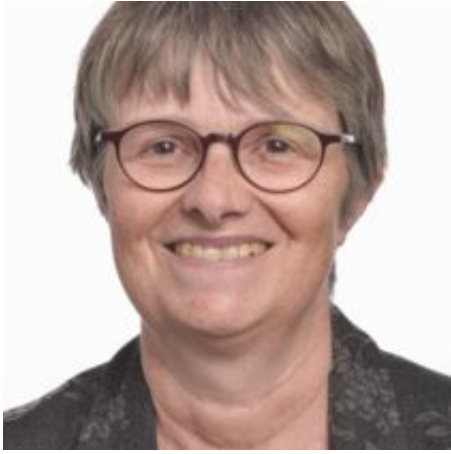
Molly Scott Cato