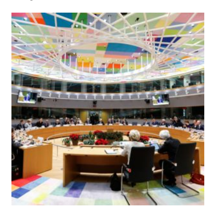
EPP, S&D, Renew Europe, Greens/EFA and ECR Leaders cal...