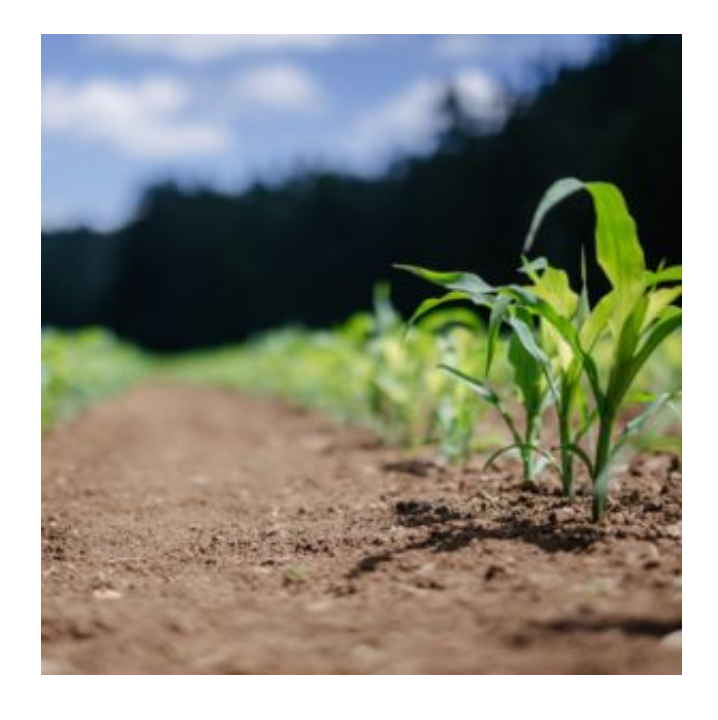
GMO-Free Europe Conference '23