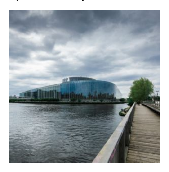
Debriefing of the April 2025 Plenary Session