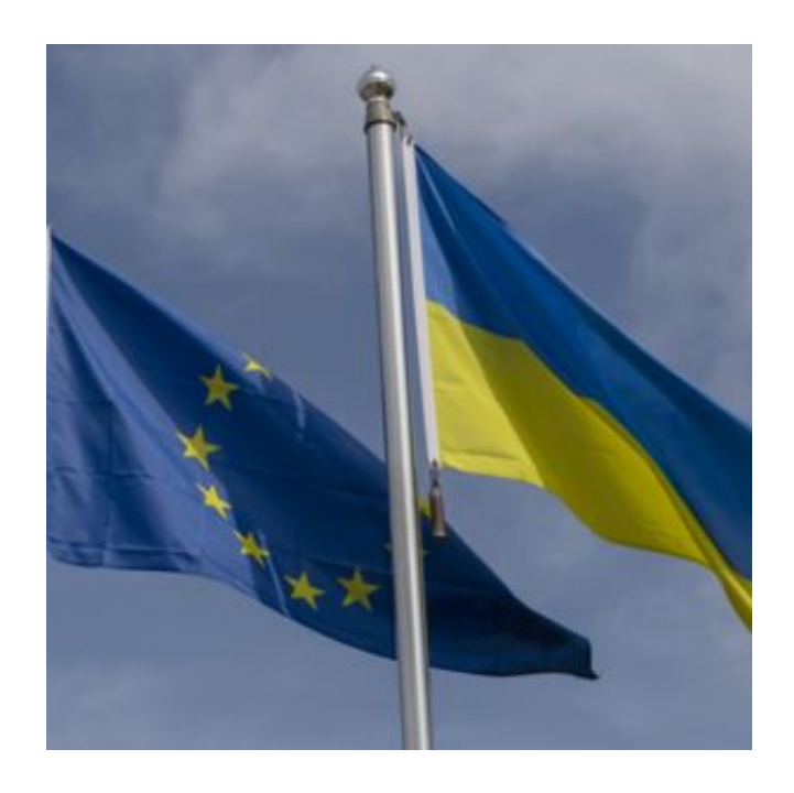
EU leaders must stand firm on support for Ukraine & ca...