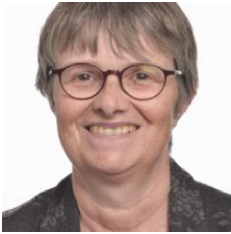
Molly Scott Cato