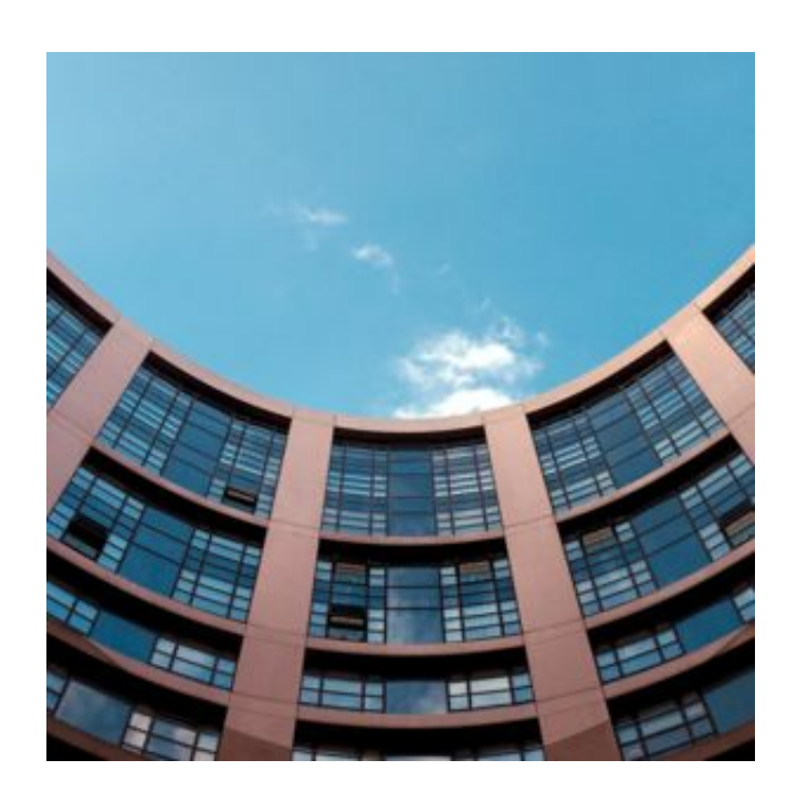
Debriefing of the June 2025 Plenary Session