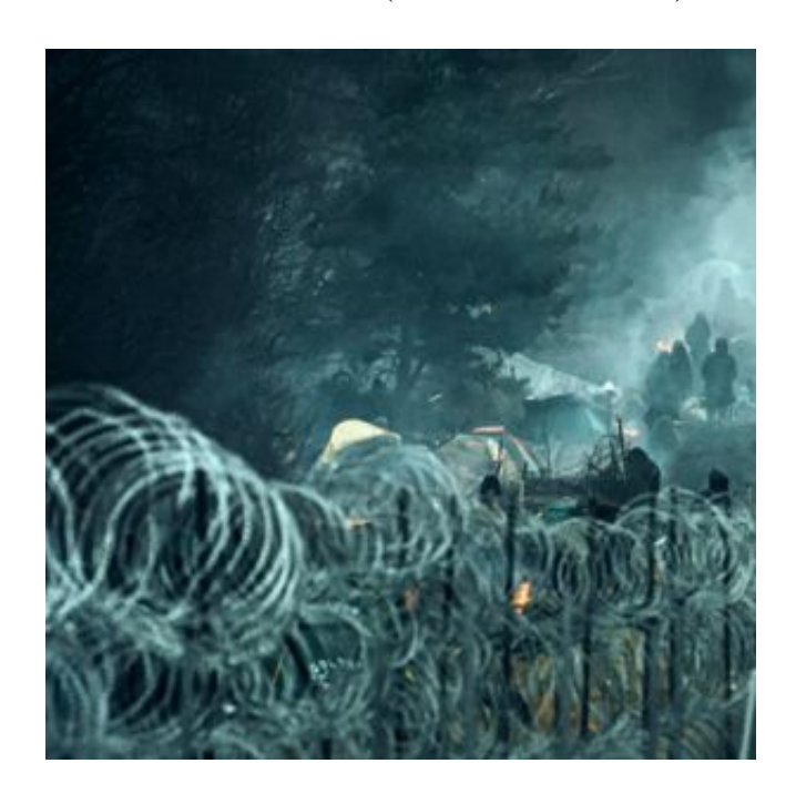
Live Q&A on EU external borders: Human lives instrumen...