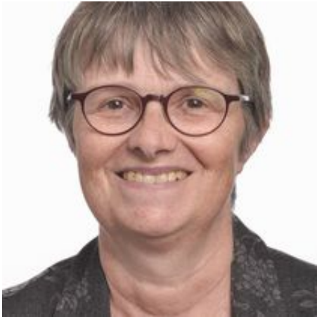
Molly Scott Cato