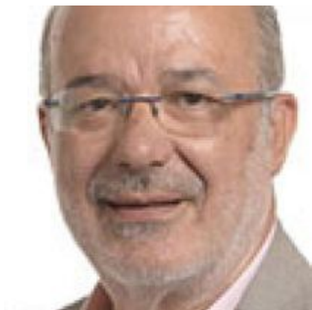
Josep Maria Terricabras

EFA President and first Vice President of the Greens/EFA Group