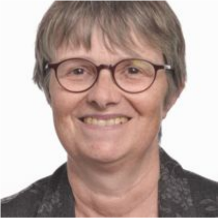
Molly Scott Cato