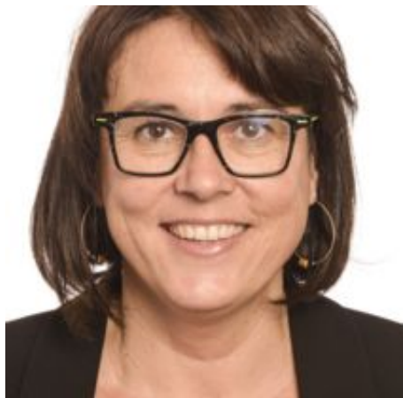
Diana Riba i Giner

EFA President and first Vice President of the Greens/EFA Group