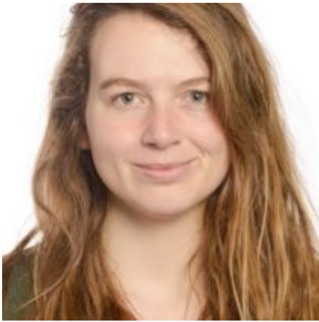
Kim Van Sparrentak