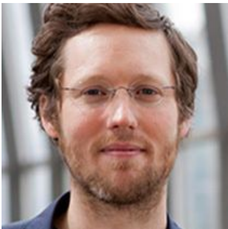
Jan Philipp Albrecht