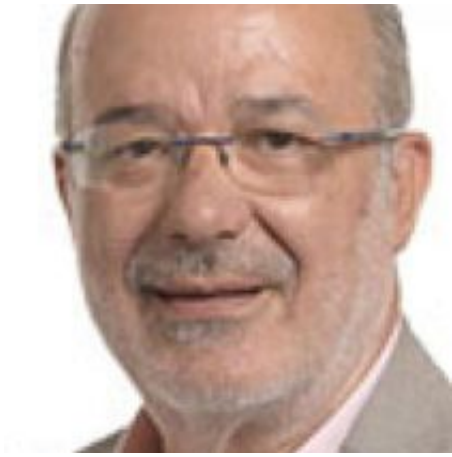
Josep Maria Terricabras

EFA President and first Vice President of the Greens/EFA Group