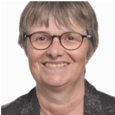
Molly Scott Cato