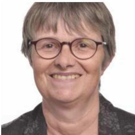
Molly Scott Cato