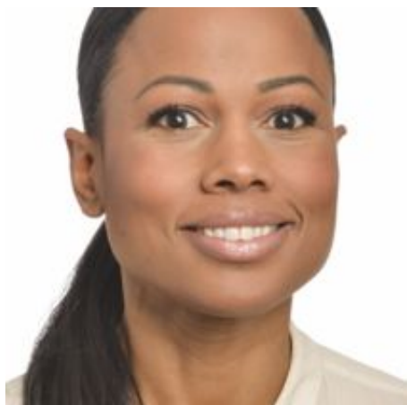
Alice Bah Kuhnke