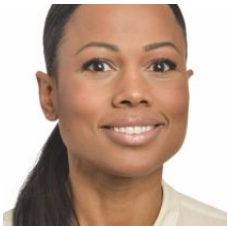
Alice Bah Kuhnke