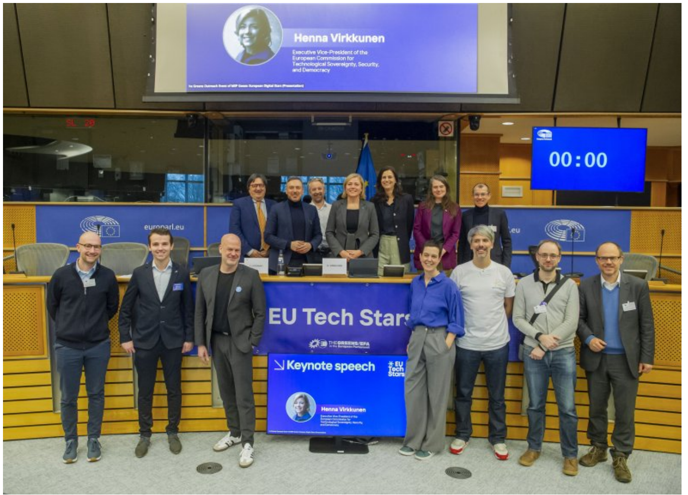
Tech Star Event 2026 Group Foto

View photos from the EU Tech Stars Summit here or use the QR code below.