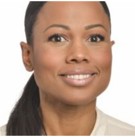
Alice Bah Kuhnke