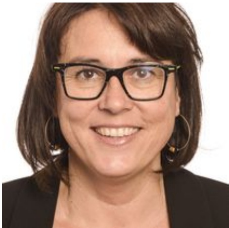
Diana Riba i Giner

EFA President and first Vice President of the Greens/EFA Group