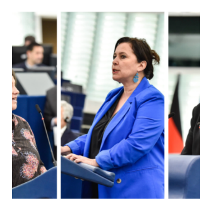
The EU-Chile Trade Agreement: A challenge to European ...