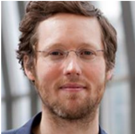
Jan Philipp Albrecht