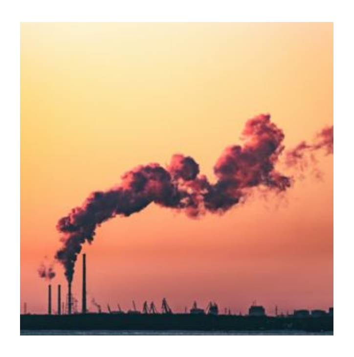
EU climate target for 2040