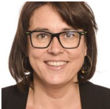
Diana Riba i Giner

EFA President and first Vice President of the Greens/EFA Group