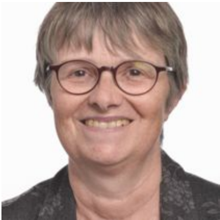
Molly Scott Cato