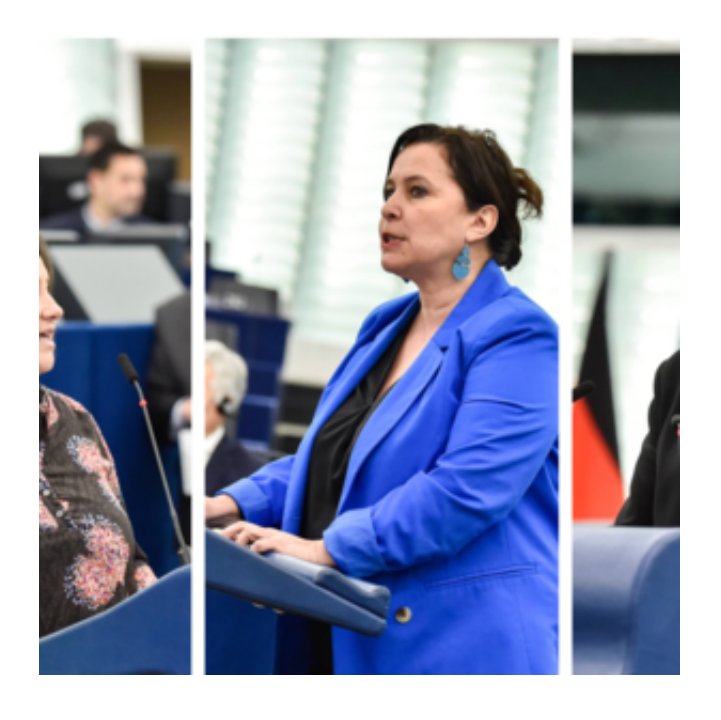
The EU-Chile Trade Agreement: A challenge to European ...