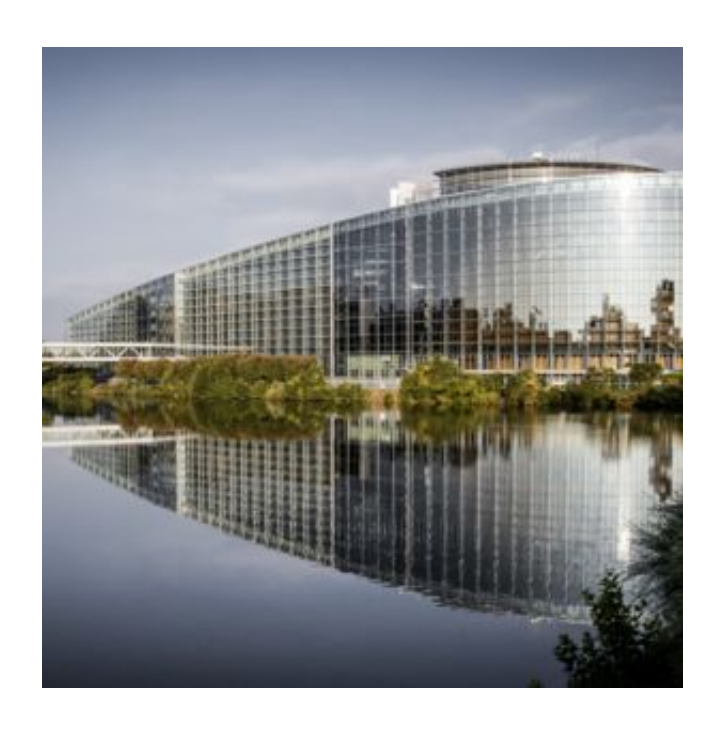
Plenary Flash: Greens/EFA Priorities 16 to 19 June