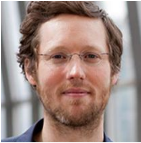
Jan Philipp Albrecht