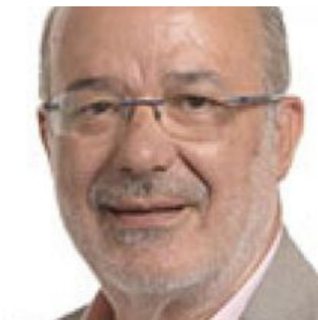
Josep Maria Terricabras

EFA President and first Vice President of the Greens/EFA Group