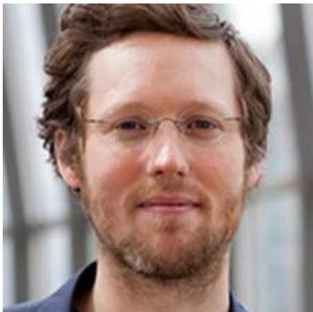
Jan Philipp Albrecht