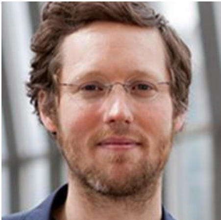
Jan Philipp Albrecht