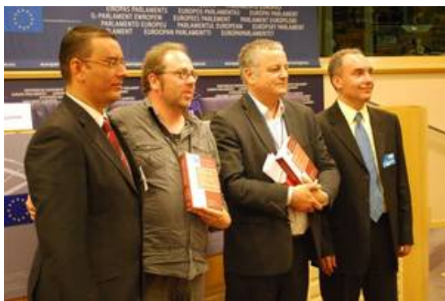
Launching the first Macedonian-Greek dictionary at the European Parliament

The Centre Maurits Coppieters www.ideasforeurope.eu promotes policy research at a European and international level.