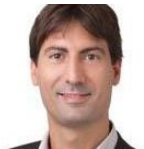
Jordi Solé i Ferrando