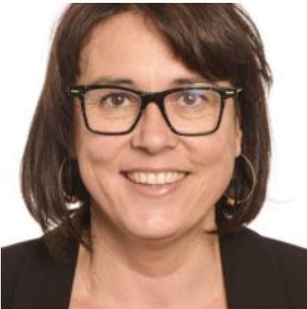
Diana Riba i Giner