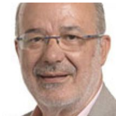
Josep Maria Terricabras

EFA President and first Vice President of the Greens/EFA Group