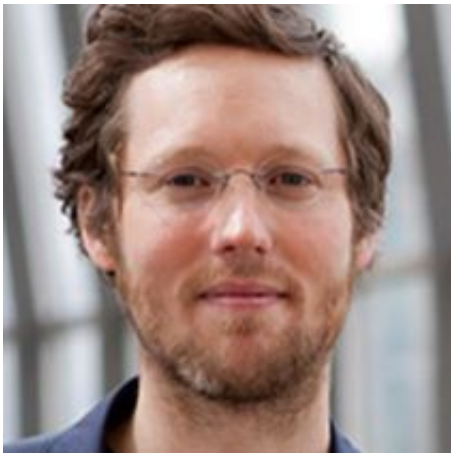
Jan Philipp Albrecht