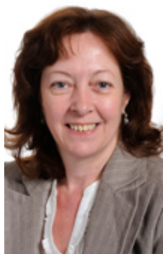
Plaid Cymru MEP Jill Evans (Wales)

Jill Evans says that 'geoblocking' – or blocking access to online content based on location – can negatively impact minority language speakers.