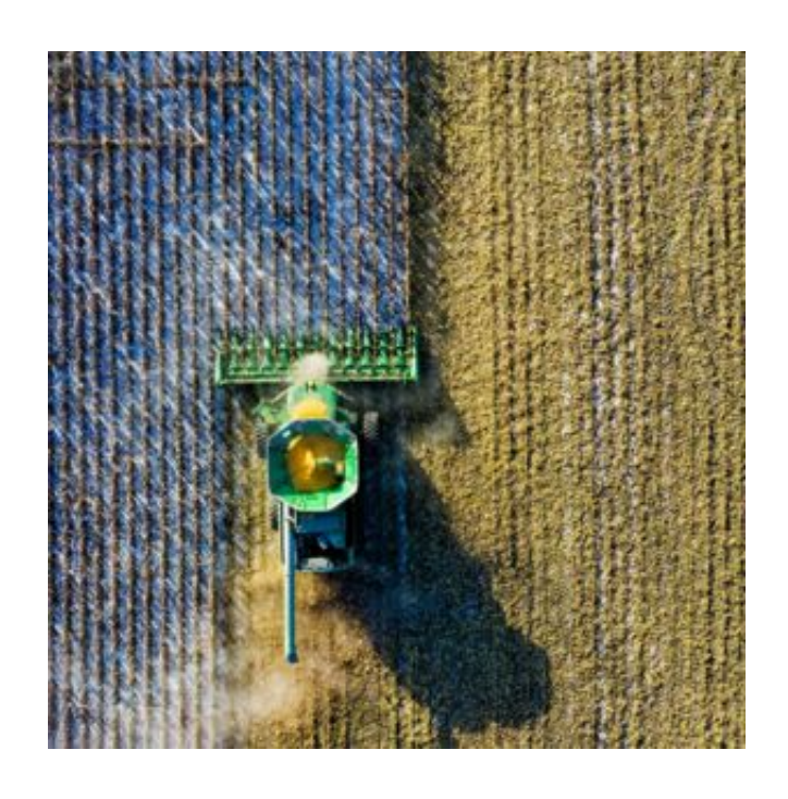
EU Parliament continues to support big Agri over small...