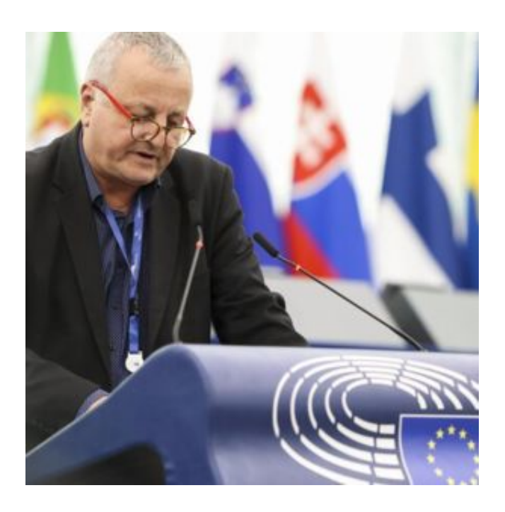
EFA MEPs vote against STEP