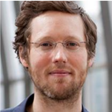
Jan Philipp Albrecht