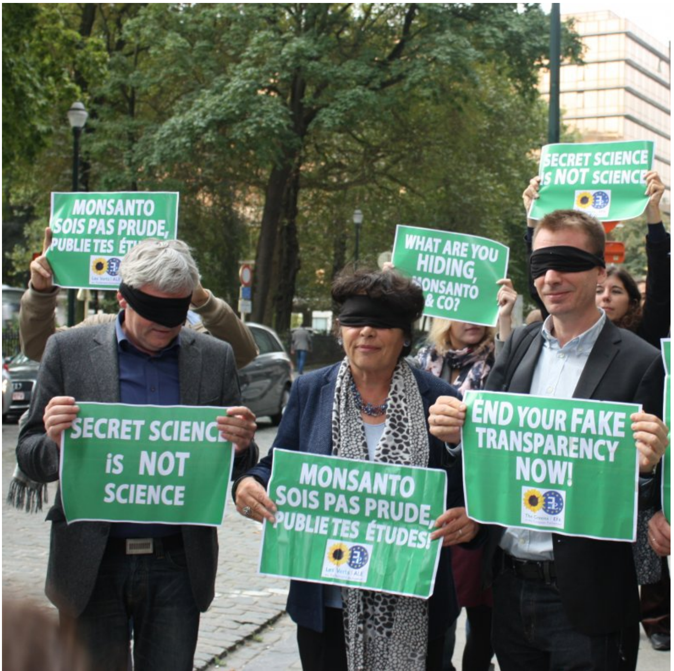
Secret Science is not Science

But it wasn't so simple. Despite the EU law on access to documents which gives any person the right to request information from the EU institutions, EFSA refused to publish the studies . They argued that they could not publish the studies because it would harm the commercial interests of the companies that had produced them.