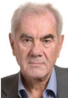
Catalan MEP Ernest Maragall

Deep divisions over how to proceed with accession talks are making it impossible to reach a consensus.