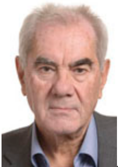
MEP Ernest Maragall

Mr Maragall, a member of the European Parliament's Turkey Delegation, said the answer to the situation was 'more democracy'.