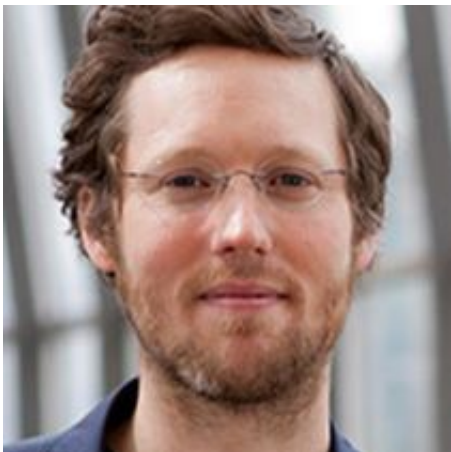
Jan Philipp Albrecht