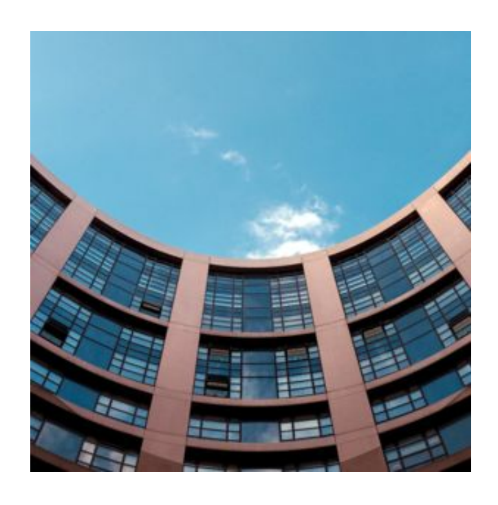
Debriefing of the June 2025 Plenary Session