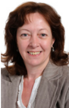
MEP Jill Evans

Jill Evans was speaking on behalf of the Greens/EFA group in the European Parliament's debate on the application of the EU's Postal Services Directive.