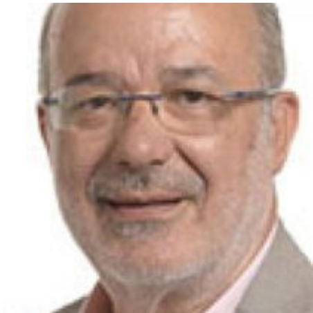
Josep Maria Terricabras

EFA President and first Vice President of the Greens/EFA Group