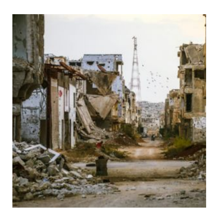
Let's support Syrians in rebuilding